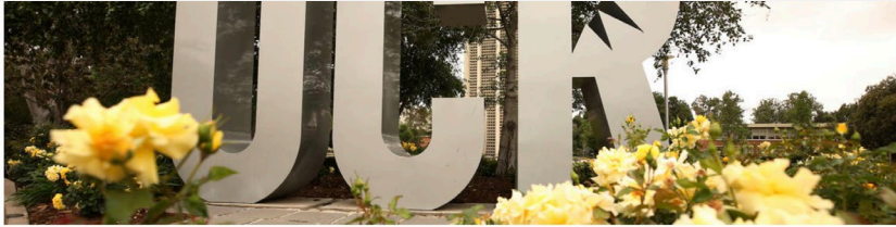
SOE honors two alumnae for Teacher Appreciation Week